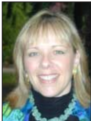
Harbor Country® Chamber of Commerce