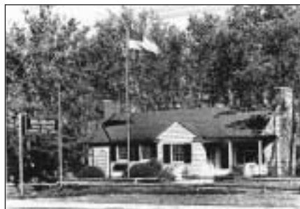
Michigan's (and the Nation's) first tourist information center.