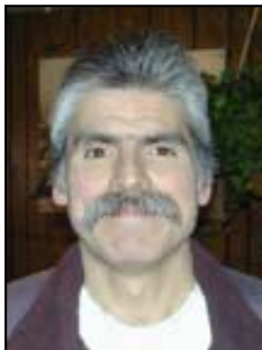
Harbor Country® Lodging Association