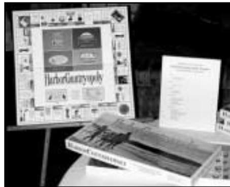
HarborCountryopoly on display at Skip's