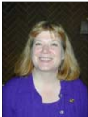
Harbor Country® Chamber of Commerce